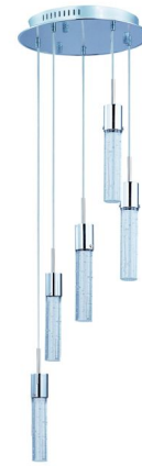
Shown in polished chrome / clear

PRODUCT DIMENSIONS . . . . . Max Overall Height: 134" LAMP COLOR . . . . . 3300K LUMENS/WATT . . . . . 164.00 LUMINOUS FLUX . . . . . 1230 lumens