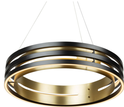
Shown in black / brushed brass