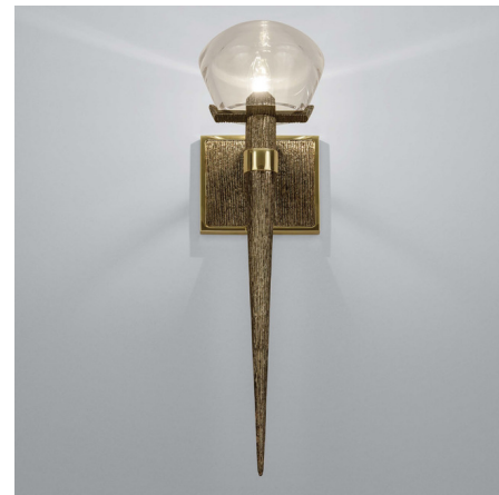
Shown in antique brass body / polished brass frame / clear

The Comet Wall Sconce offers an intriguing juxtaposition of textured cast brass and sleek machined accents for an eye-catching display. With a pointed shape inspired by railroad nails, Comet cuts a striking silhouette against the wall. The sconce is capped by a glass shade to complete the look and softly disperse light.