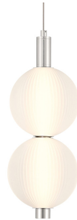
Shown in polished nickel / frosted