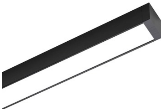
Shown in: Satin Black

Cirrus Channel Ceiling Flush Wet Location features a direct flat lens with 100 degree beam spread. Includes 5 watts, 24 volt LED per foot with 2700K color temperature, 95+CRI LED. Finish available in Satin Black. Channel includes a split canopy that mounts on a standard junction box. May be ordered with a Slim Profile Channel Junction Box (C-IRE-JBOX), sold separately. Mounting clips (C-MCL) are included for use every 18 inches. Can be powered using a Class 2 electronic low voltage, 0-10 volt or Lutron Hi-Lume power supply. In-wall mounting kits available for select power supplies. See attached manufacturer reference for dimmer compatibility. ETL listed. 5 year warranty. IP64 rated for covered areas in wet locations. Major components made and assembled in the USA. Required power supply and dimmer control sold separately. Product is built to order.