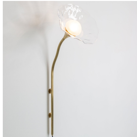
Shown in brass / clear

The Bloom Plug-In Wall Sconce offers an elegant aesthetic inspired by the delicate natural form of flowers. The sconce's machined brass stem is juxtaposed with organic handblown glass shades for a striking contrast, and the ends of the stems are hand-formed to evoke the look of actual flowers. Each Bloom Sconce is handmade, resulting in unique variations that make each a one-of-a-kind work of art. Overall dimensions may vary by 1 to 3 inches. Floor dimmer switch located on cord.