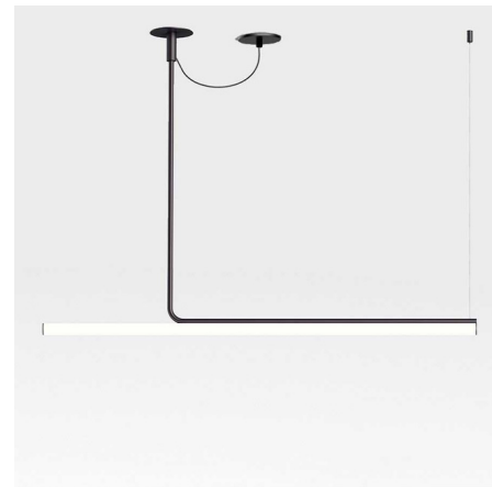
Shown in black

COLOR RENDERING . . . . . 90 CRI LAMP COLOR . . . . . 2700K LUMENS/WATT . . . . . 98.49 LUMINOUS FLUX . . . . . 1891 lumens