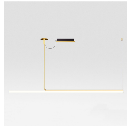
Shown in matte gold

The Ambrosia Linear Suspension with Surface Canopy is a contemporary re-imagining of classic Linestra-style linear lamps that showcases how a function-forward, technical design can also offer a poetic decorative expression. At the center of the design is a tubular methacrylate diffuser, which is lit from within by integrated LEDs to produce gentle illumination suitable for a wide variety of applications. Ambrosia's sleek metal frame gracefully curves upward into the downstem which supports the pendant from the ceiling. This version of the Ambrosia Linear Suspension includes a rectangular surface mounted canopy, which is installed on a junction box and houses the power supply (0-10V dimmable). The canopy may be mounted on the wall or ceiling.