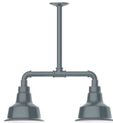
Shown in slate gray