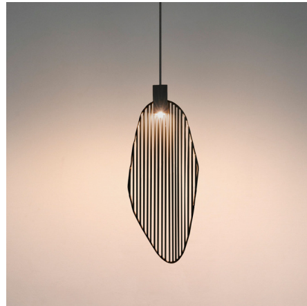
Shown in white / matte black nickel

PRODUCT DIMENSIONS . . . . . Canopy: 4.7" diameter COLOR RENDERING . . . . . 90 CRI LAMP COLOR . . . . . 3000K LUMENS/WATT . . . . . 112.86 LUMINOUS FLUX . . . . . 237 lumens