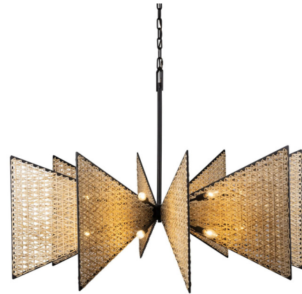
Shown in matte black / natural sulihya

COLOR . . . . . N/A BODY FINISH . . . . . Matte Black / Natural Sulihya WATTAGE . . . . . 80W DIMMER . . . . . Standard 120V DIMENSIONS . . . . . 48"W x 33"H BULB NOT INCLUDED . . . . . 16 x B10/Candelabra (E12)/5W/120V LED COUNTRY OF ORIGIN . . . . . Philippines