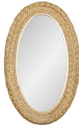
Shown in natural / mirror

Crafted with meticulous care, the hand-made Athena Oval Mirror is a testament to the artistry of skilled artisans who have woven together two distinct elements - sea grass and recycled steel - to create a unique and visually captivating piece. Inspired by the intricate braids adorning the hair of the Greek goddess Athena, this mirror embodies elegance, strength, and sustainability in perfect harmony. Can be mounted vertically or horizontally.