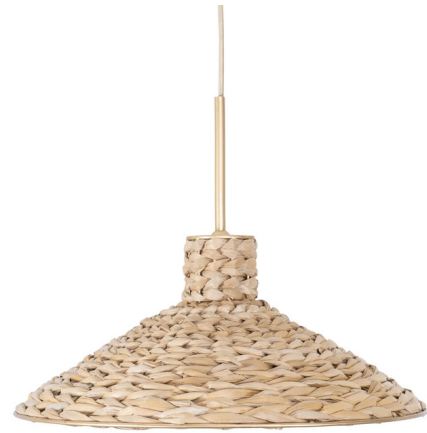
Shown in french gold / natural