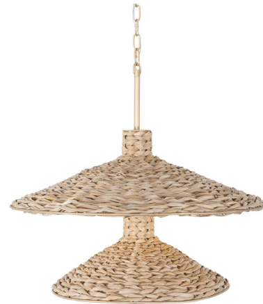
Shown in french gold / natural

COLOR . . . . . Natural BODY FINISH . . . . . French Gold WATTAGE . . . . . 45W DIMMER . . . . . Standard 120V DIMENSIONS . . . . . 26.25"W x 17"H BULB NOT INCLUDED . . . . . 9 x B10/Candelabra (E12)/5W/120V LED COUNTRY OF ORIGIN . . . . . Philippines