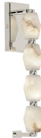
Shown in polished nickel / alabaster

LAMP LIFE . . . . . 50000 hours COLOR RENDERING . . . . . 90 CRI LAMP COLOR . . . . . 2700K LUMENS/WATT . . . . . 40.74 LUMINOUS FLUX . . . . . 220 lumens