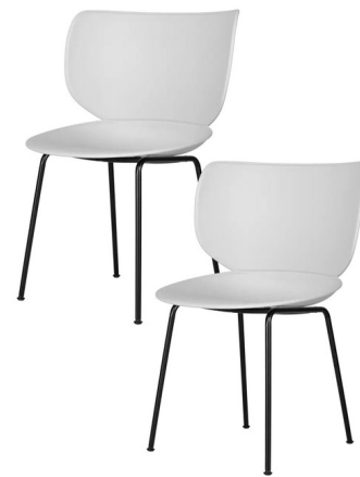
Shown in black / concrete grey

PRODUCT DIMENSIONS . . . . . Seat Height: 18.1"