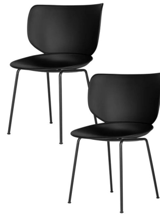
Shown in black / black

The Hana Stackable Dining Chair was inspired by the unfurling petals of a flower with an organic silhouette and gently curved lines. The encompassing polypropylene shell offers comfort and support without sacrificing aesthetics, making Hana a perfect fit for dining rooms, offices, or anywhere additional seating is needed. Up to 5 chairs can be stacked while not in use for easy storage. Includes one set of 2 chairs.