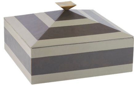
Shown in dove gray leather / graphite leather

The Cheshire Box features tonal stripes add a tailored finish in a two-toned dove and graphite leather box. This pyramid-inspired accessory is topped with a bronze-plated handle that reflects its geometric lines. Lined in soft suede.