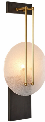
Shown in antique brass / clear

The Clover Wall Sconce is inspired by the strings of instruments. The clamped and pierced structure of this piece is held by accents of antique brass-plated steel, while the disc of clear seeded slump glass diffuses a single bulb.