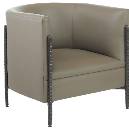
Shown in bronze / dove gray leather

The Escondido Lounge Chair is a barrel-shaped chair of dove leather was designed to cradle your form with comfort and style. Framed in bronzed steel with a dimpled texture, the Escondido's supportive back post aligns with the stitching of the cushion. Finished with frame pulls for easy portability within a room.