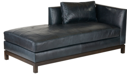
Shown in grey / ink

The Edmond Chaise is a sophisticated chaise of ink leather was inspired by midcentury modern proportions, updated for a modern age. Its buttery soft cushion and pillow are patchworked for visual interest, as the differing tonality of the leather adds subtle dimension. Mounted on a sturdy rectangular base with block legs of grey ash wood.