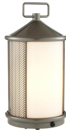
Shown in opal