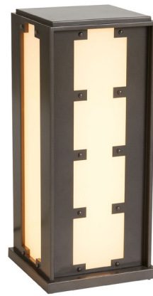
Shown in opal