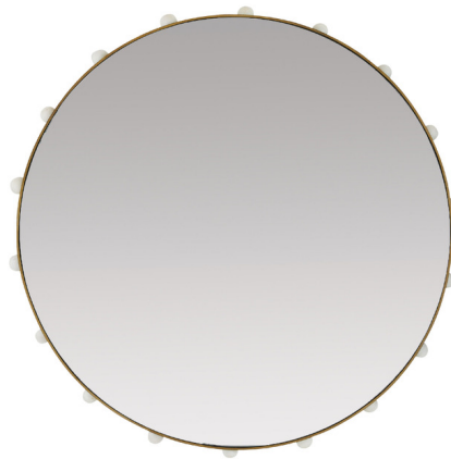
Shown in gold / mirror

The Estera Mirror is reminiscent of a jewelry bezel on the band of a ring. We elevated a classic round mirror by framing it in antique brass iron and adorned with white marble baubles. Secured with a cleat at the back for hanging.