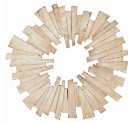
Shown in limed wood

The Cosmo Plaque is a sandblasted round of lime-washed mango wood adds an explosive impact to any wall. Crafted with a stacked sunburst shape to add dimension and laminated for durability, this chic accessory can be displayed all four ways. A D-ring attachment assures secure hanging.