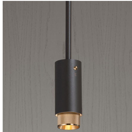
Shown in graphite / brass

The Exhaust Pendant features the Buster + Punch signature linear or cross pattern knurl baffle that captures light and creates a delicate metallic glow. An included honeycomb filter emits a precise, non-glare, directional spotlight. Available with a Graphite or Stone finish and matching flush canopy complemented by a variety of baffle finishes. Note: Not all finish combinations are available.