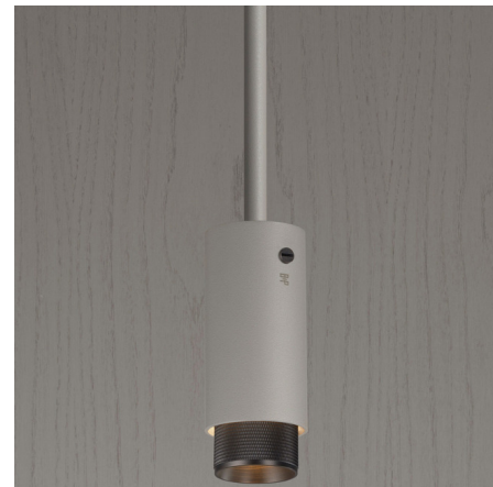
Shown in stone / smoked bronze

The Exhaust Pendant features the Buster + Punch signature linear or cross pattern knurl baffle that captures light and creates a delicate metallic glow. An included honeycomb filter emits a precise, non-glare, directional spotlight. Available with a Graphite or Stone finish and matching flush canopy complemented by a variety of baffle finishes. Note: Not all finish combinations are available.