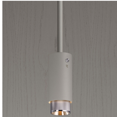
Shown in stone / steel

The Exhaust Pendant features the Buster + Punch signature linear or cross pattern knurl baffle that captures light and creates a delicate metallic glow. An included honeycomb filter emits a precise, non-glare, directional spotlight. Available with a Graphite or Stone finish and matching flush canopy complemented by a variety of baffle finishes. Note: Not all finish combinations are available.