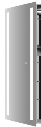
Shown in matte silver / mirror

COLOR RENDERING . . . . . 90 CRI LAMP COLOR . . . . . 3000K LUMENS/WATT . . . . . 124.09 LUMINOUS FLUX . . . . . 11168 lumens