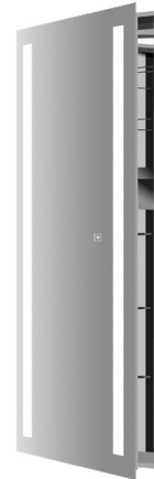
Shown in matte silver / mirror

COLOR RENDERING . . . . . 90 CRI LAMP COLOR . . . . . 3000K LUMENS/WATT . . . . . 124.09 LUMINOUS FLUX . . . . . 11168 lumens