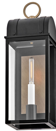
Shown in black / burnished bronze / clear

Inspired by traditional colonial lanterns, the Campbell Outdoor Wall Light's carriage house styling complements classic architecture accentuated by a bold arched roof and a cast top ring. Lamps with contrasting warm white candle sleeves are enhanced by a Black with Burnished Bronze finish and a reflective backplate.