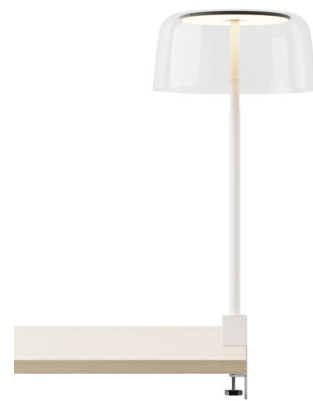
Shown in matte white

COLOR RENDERING . . . . . 90 CRI LAMP COLOR . . . . . 3000K LUMENS/WATT . . . . . 54.29 LUMINOUS FLUX . . . . . 760 lumens