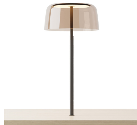
Shown in matte black

COLOR RENDERING . . . . . 90 CRI LAMP COLOR . . . . . 3000K LUMENS/WATT . . . . . 54.29 LUMINOUS FLUX . . . . . 760 lumens