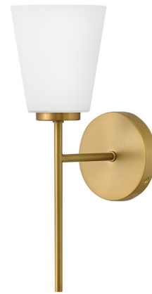
Shown in lacquered brass / opal

Simply stylish, the Bri Wall Sconce's versatile profile features a transitional tapered shade made from soft white Etched Opal Glass. A classic finish is designed to easily complement any space or decor. Can be mounted up or down.