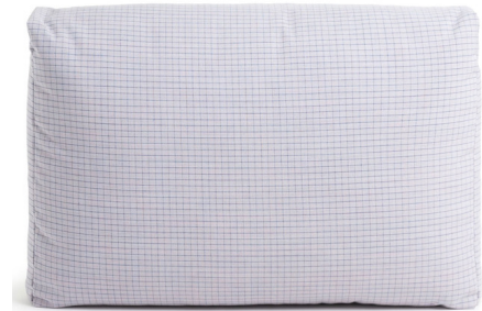
Shown in kvadrat recheck 125

The Costume Lounge Modular Back Support Cushion is made of a recyclable fabric that can be removed for cleaning or replacing. This Costume piece is a back support cushion for the Costume modular system (sold separately).