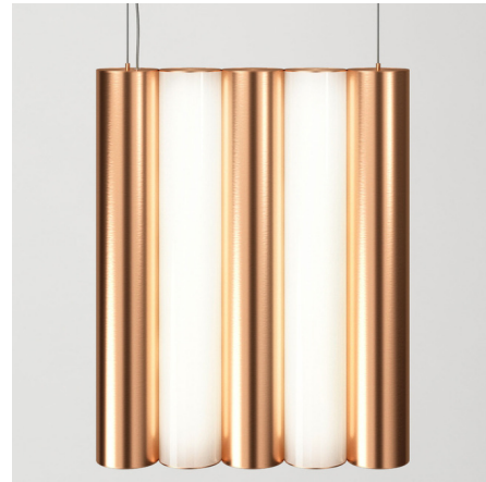
Shown in satin copper / opal

The Gamma Pendant combines simple elements to create a visually striking light fixture. The pendant is composed of alternating slender metal tubes and cylindrical opal polycarbonate diffusers to produce pleasantly diffused illumination.