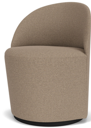
Shown in black / flint logan

The Tearoom Swivel Side Chair features a timeless silhouette that is inviting without being overly casual. Inspired by the curved frame of Charles Rennie Mackintosh's 1904 Willow Chair, this piece features a gently curving back and sides over plywood and foam construction, ensuring it is as comfortable as it is stylish. The upholstered seat sits atop a return swivel base that rotates 190 degrees. The Tearoom Side Chair would make a striking addition to both period and contemporary hotels, lounges, or even private residences.