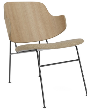
Shown in black / natural oak / beige baru

Originally designed by Danish architect Ib Kofod-Larsen in 1953, the Penguin Lounge Chair remains popular today as an icon of Scandinavian mid-century design. Penguin is lightweight and elegant, with a gently curved upholstered back and seat crafted from plywood. The steel legs provide a stable base and contrast the chair's organic curves with straight lines.