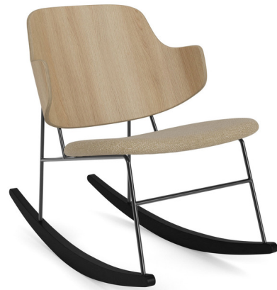
Shown in black / natural oak / beige baru

Originally designed by Danish architect Ib Kofod-Larsen in 1953, the Penguin Rocking Chair remains popular today as an icon of Scandinavian mid-century design. Penguin is lightweight and elegant, with a gently curved upholstered back and seat crafted from plywood. The steel frame contrasts the chair's organic curves with straight lines, while the solid wood rocker legs echo the organic nature of the design.