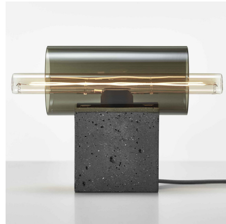
Shown in smoke grey glossy / anthracite concrete

LAMP LIFE . . . . . 20000 hours COLOR RENDERING . . . . . 90 CRI LAMP COLOR . . . . . 2700K LUMENS/WATT . . . . . 76.67 LUMINOUS FLUX . . . . . 460 lumens