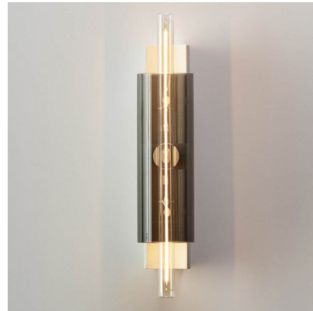
Shown in white concrete / smoke grey

LAMP LIFE . . . . . 20000 hours COLOR RENDERING . . . . . 90 CRI LAMP COLOR . . . . . 2700K LUMENS/WATT . . . . . 76.67 LUMINOUS FLUX . . . . . 460 lumens