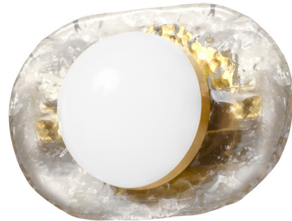
Shown in aged brass / clear / frost

LAMP LIFE . . . . . 30000 hours COLOR RENDERING . . . . . 90 CRI LAMP COLOR . . . . . 3000K LUMENS/WATT . . . . . 34.50 LUMINOUS FLUX . . . . . 345 lumens