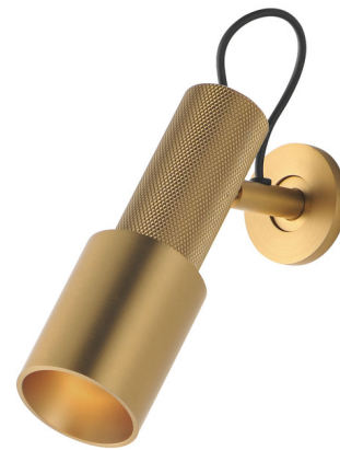
Shown in natural aged brass

LAMP LIFE . . . . . 45000 hours COLOR RENDERING . . . . . 90 CRI LAMP COLOR . . . . . 2700K LUMENS/WATT . . . . . 40.00 LUMINOUS FLUX . . . . . 200 lumens