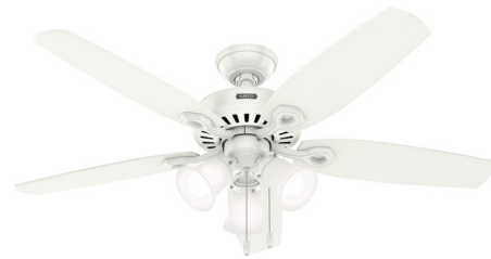
Shown in fresh white / fresh white / light oak