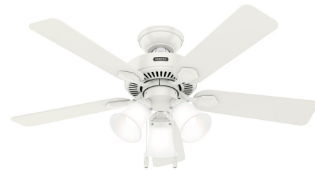
Shown in fresh white / fresh white / natural wood / clear frosted