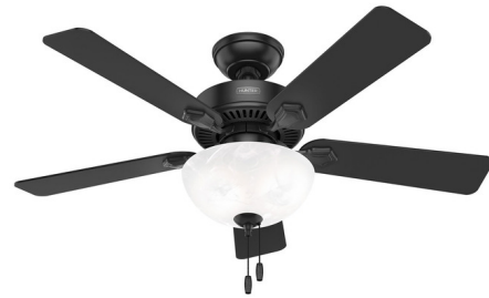
Shown in matte black / matte black / light gray oak / swirled marble

LAMP LIFE . . . . . 8000 hours COLOR RENDERING . . . . . 80 CRI LAMP COLOR . . . . . 3000K LUMENS/WATT . . . . . 171.43 LUMINOUS FLUX . . . . . 1200 lumens