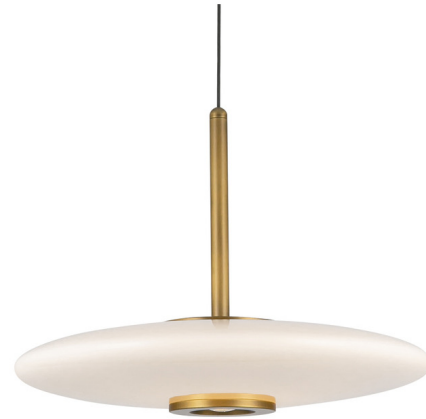
Shown in vintage brass / glossy opal