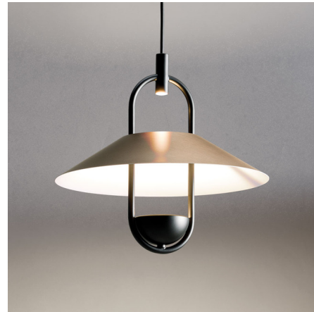
Shown in matte black / brushed pure gold

COLOR RENDERING . . . . . 90 CRI LAMP COLOR . . . . . 3000K LUMENS/WATT . . . . . 142.32 LUMINOUS FLUX . . . . . 1779 lumens