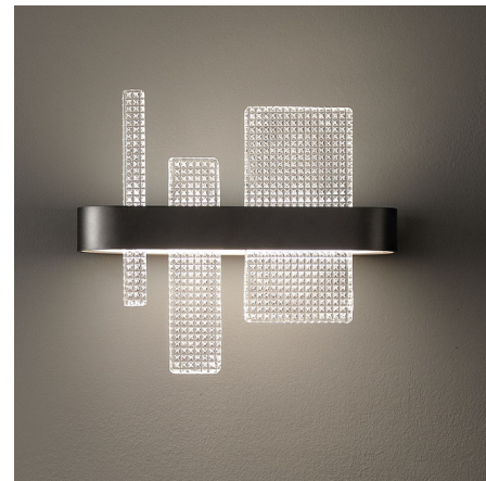
Shown in matte black / transparent

The Ribbon Wall Sconce features a slim, painted metal frame equipped with a linear LED strip along its length. Textured glass panels protrude from the top and bottom of the sconce and are lit along the edges to produce a soft ambient glow. Light is directed both upward and downward from the top and bottom of the sconce.