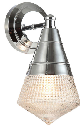
Shown in polished chrome / prairie rib frost

A prismatic diffusion of light is housed within pressed cone glass shades in the Hargreaves Wall Light. A glass shade is then supported by a finished metal ring. Can be installed up or down. Dimmable via Triac or electronic low voltage (ELV) dimming.