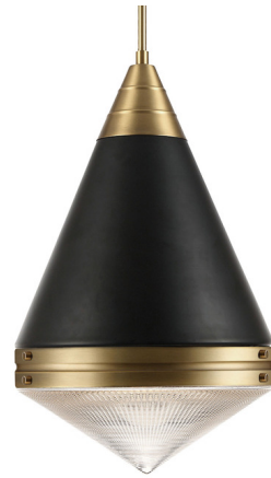
Shown in aged brass / black / prairie rib frost

A prismatic diffusion of light is housed within pressed cone glass shade in the Hargreaves Pendant. Halves conceal the light source supported by a metal ring. Dimmable via Triac or electronic low voltage (ELV) dimming.